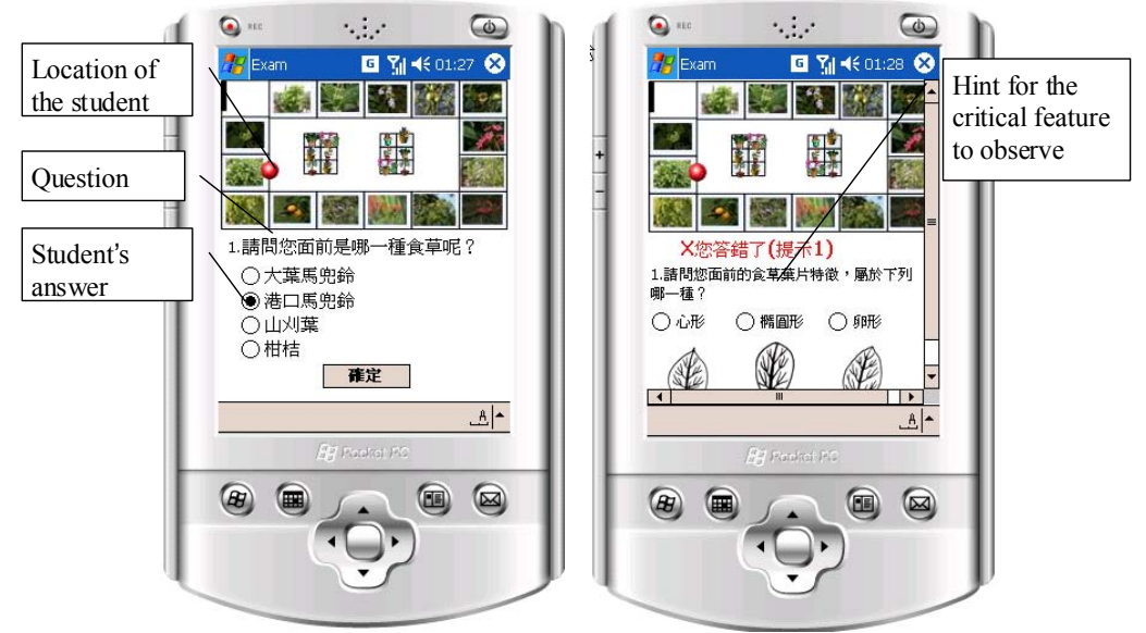
Figure 4. Illustrative example of guiding the student to observe the critical feature of the plant