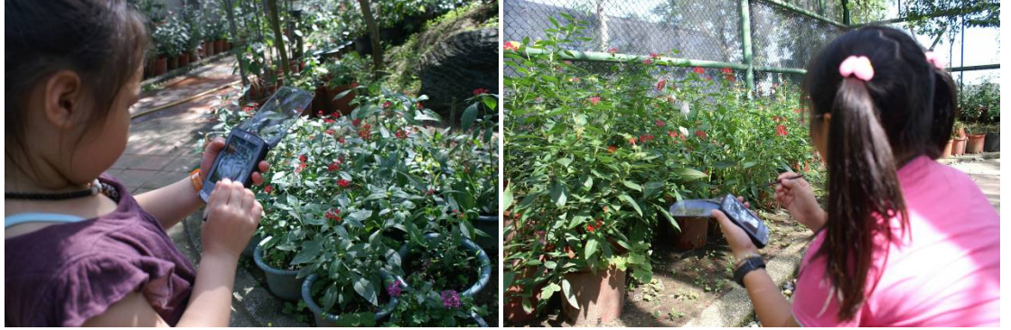
Figure 3. The butterfly ecology garden